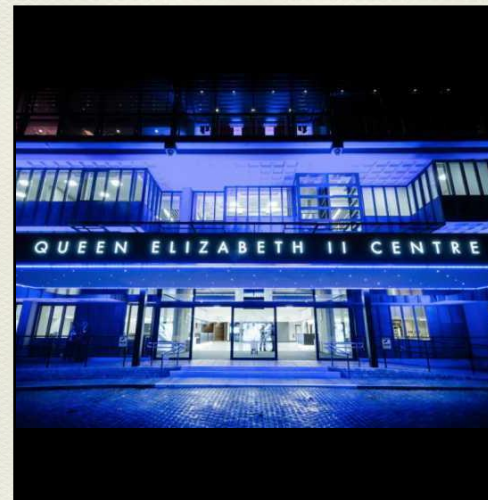
QUEEN ELIZABETH II CENTRE