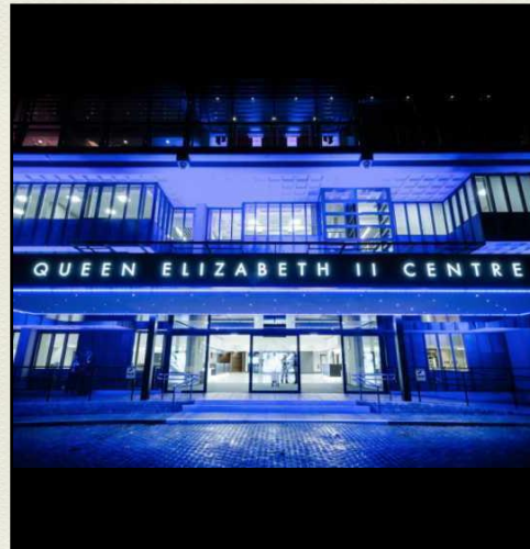
QUEEN ELIZABETH II CENTRE