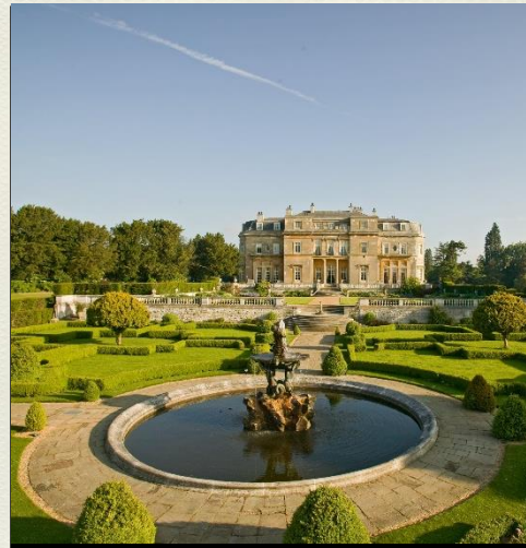
LUTON HOO, GOLF & SPA